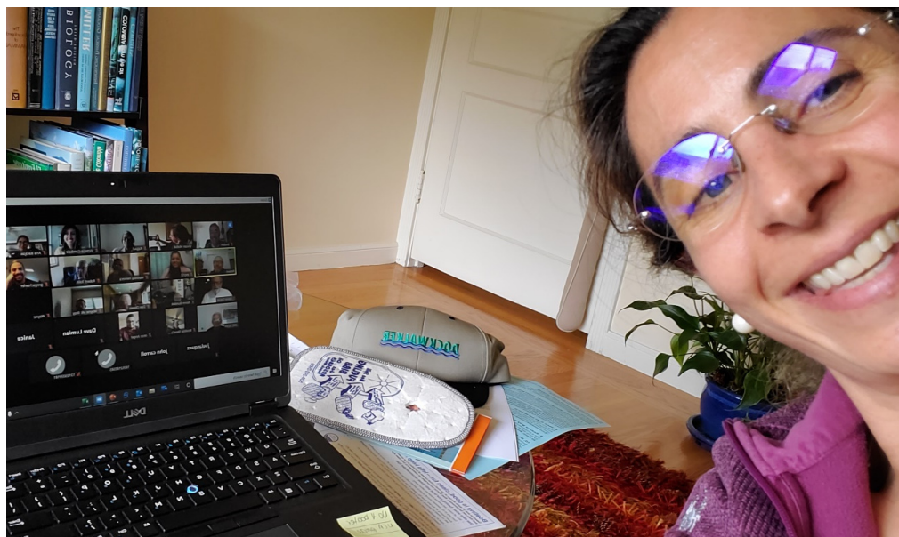
Partner Dockwalkers at one of the 2020 Virtual Trainings

This year has been a unique one, bringing many challenges. However, challenges can also bring new opportunities, which it did for the Dockwalker Program. Due to COVID-19, this year the Dockwalker partners – California State Parks, the California Coastal Commission, and The Bay Foundation – quickly redesigned the in-person trainings and transitioned to virtual trainings. We were able to offer 13 Dockwalker virtual trainings to 187 participants!