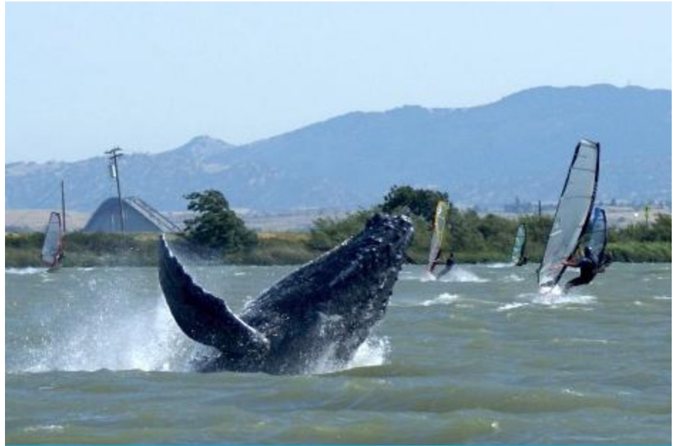
Humpback Whale Delta/Dawn (breaching in Sacramento River)