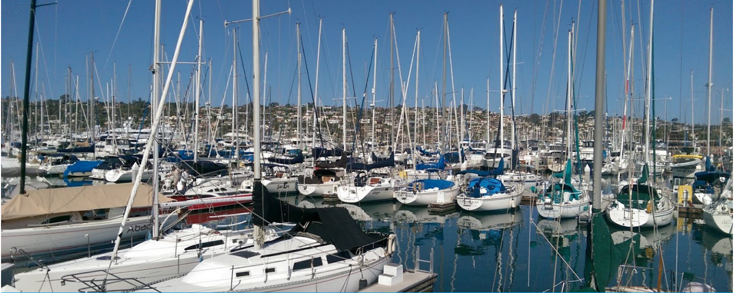
Shelter Island, San Diego

Boaters with onboard heads have options for disposing their sewage, but discharging overboard within a marina is not one of them. Not only is this practice unsanitary, it is also illegal under state and federal law ( California Health and Safety Code (CHSC) Div 14. Part 13 Section 117515 and 117525, 40 Code of Federal Regulations (CFR) 140.3(a)(1) and 33 CFR 159.7(b) and (c) ). Sewage in the waterways can lead to human and health issues from bacteria, viruses, and parasites. It can also cause excessive algae and plant growth, which limits the use of watercraft and affects marine life.