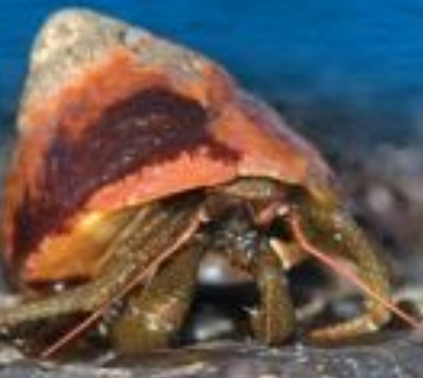
Image above: Point Lobos below: hermit crab

Offer recreational and economic opportunities